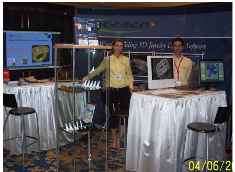
Vision numeric team on their booth