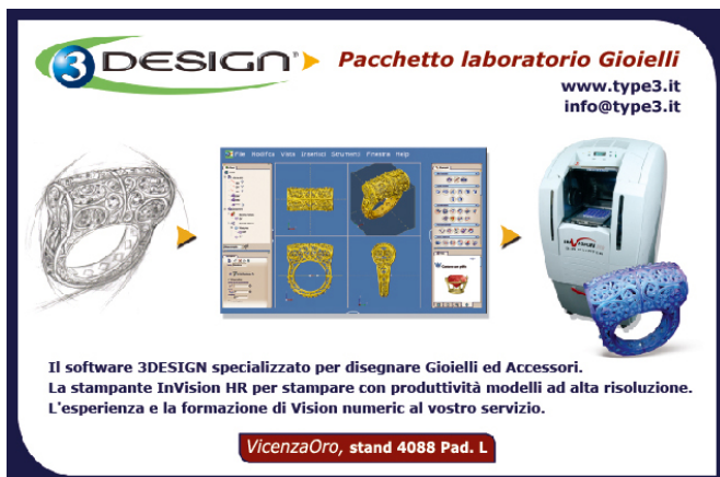
Special offer combining 3DESIGN and a machine

During the eight days of the show, Oromacchine reinforced its position as the cosmopolite meeting point for technology. Vision numeric teams from Italy and France met numerous contacts mostly from Italy, but also much from Europe (Germany, Turkey, France, etc.), Asia, the United States and even a few contacts from Australia.